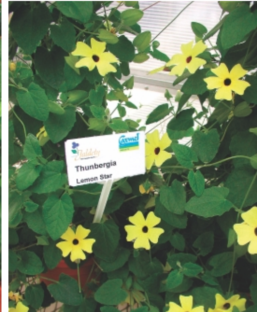
Left to right: 'Charles Star' thunbergia (Jaldety); 'Apricot Smoothie' thumbergia (Ecke); 'Orange' thunbergia (Jaldety); 'Lemon Star' thunbergia (Jaldety).