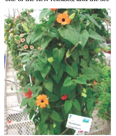
'Orange Beauty' (Jaldety)

that can take the heat. Ecke Ranch had something I had never seen before its release for next year — a lavender-pink thunbergia. Most of the Thunbergia alata hybrids are either orange or yellow tones, but this plant ('Raspberry Smoothie') was a clear lavender-pink tone, really distinct! I'm looking forward to seeing it perform in the South next year. The lavender form was only one of the new releases, and the sec-