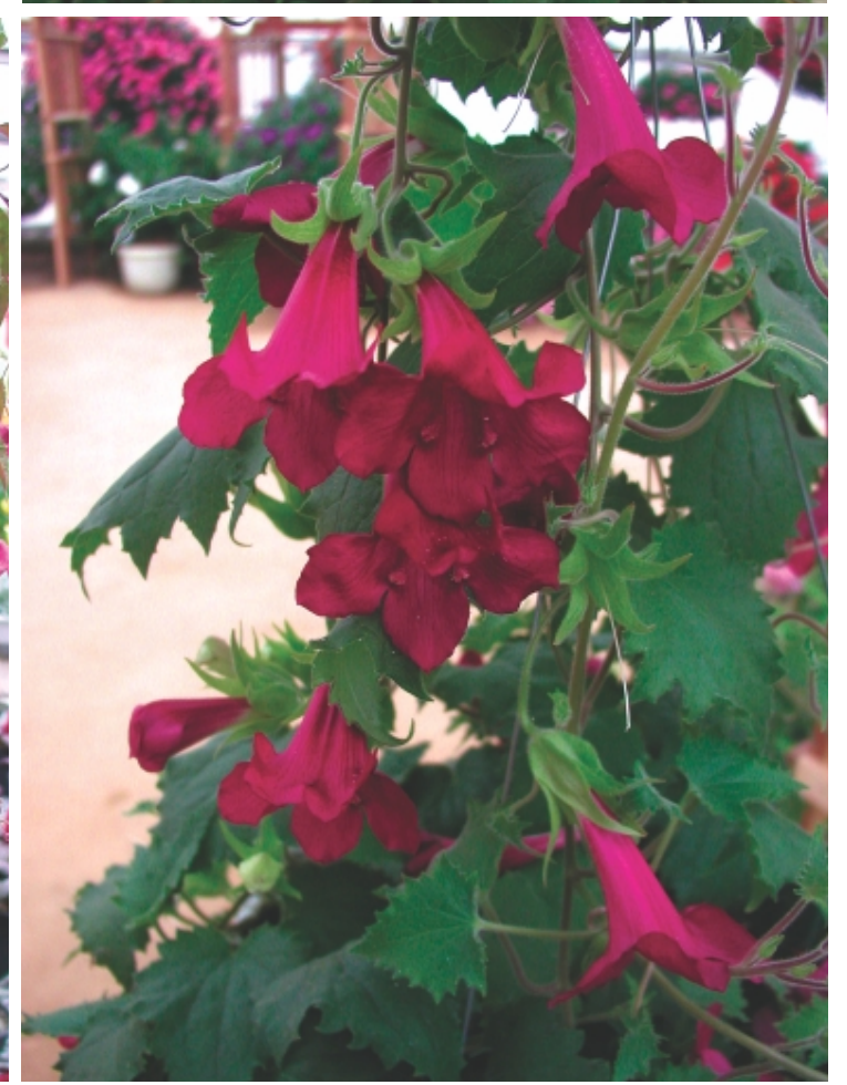
Clockwise from top: 'Raspberry Smoothie' thunbergia (Ecke); rhodochiton (Benary); 'Wine Red' lophospermum (Suntory).